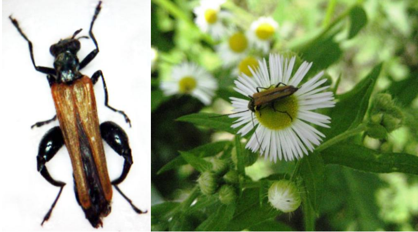
Figure 4. Oedemera femorata ♂ Oedemera femorata ♀