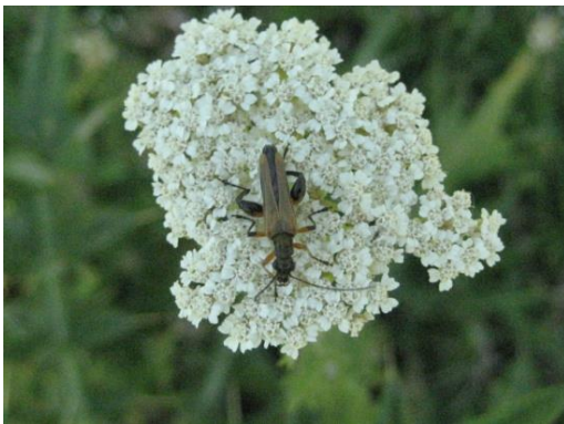
Figure 5. Oedemera (Oedemera) podagrariae ♂

Distribution: Central Europe, Turkey, Russia, Turkmenistan, Caucasus.