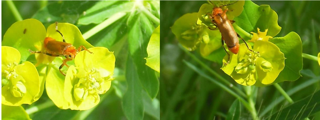
Figure 3. Cantharis melaspis Chevrolat, 1854