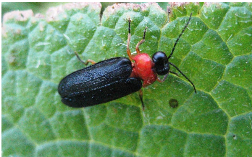
Figure 2. Luciola sp.