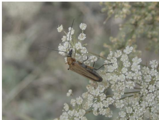
Oedemera (Oedemera) podagrariae ♀

The check list of false blister beetles is distributed in Azerbaijan is presented below: