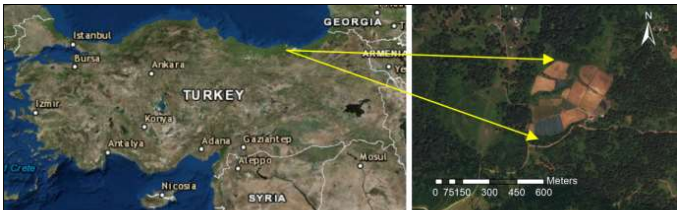
Figure 1. Geographical location of Karadağ Forest Nursery

The experiment was designed in a randomized complete block design with three replications. The location and order of replications for each treatment were randomly determined. Other than root undercutting, thinning and fertilization, cultural applications (irrigation, weed control) were carried out according to the routine work program of the Karadağ Forest Nursery. Undercutting of roots was made by passing the root undercutting knife attached to the tractor under the seedbed parallel to the soil surface.