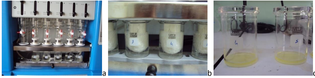
Figure 4. Soxhlet extraction (a), working of soxhlet extraction (b), fat extraction (c)

Variations among populations for fat and protein amounts were analyzed by the Kruskal Wallis test because of small sample numbers per population ( n < 30 ). To determine variations within populations, Kruskal Wallis test was also used to determine variations within three populations (Araç-Güzlük, Tosya-Küçüksekiler and Ağlı-Müsellimler) and Mann Whitney U test was used for Ağlı-Tunuslar population.