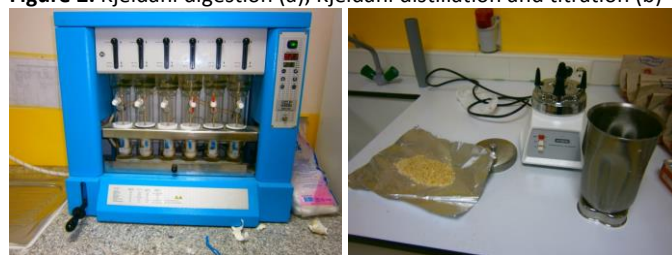
Figure 3. Fat content determination