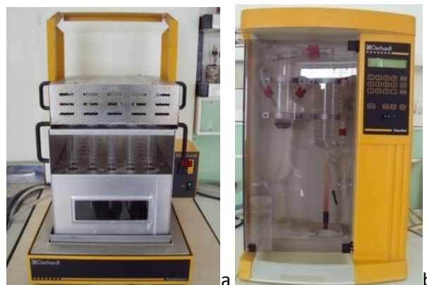
Figure 2. Kjeldahl digestion (a), Kjeldahl distillation and titration (b)

In this equation; T is the standard amount of acid (ml) reacting with ammonium during sample distillation, B is the amount of standard acid (ml) reacting with ammonium during witness distillation, N is the exact normality of standard acid and S is the amount of sample used in the analysis.