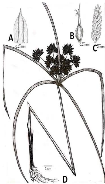
Figure 1. Cyperus eragrostis hand drawing; A) Glume, B) Ovary, C) Spikelet, D) General appearance.

Type: Described from Tropical South America.